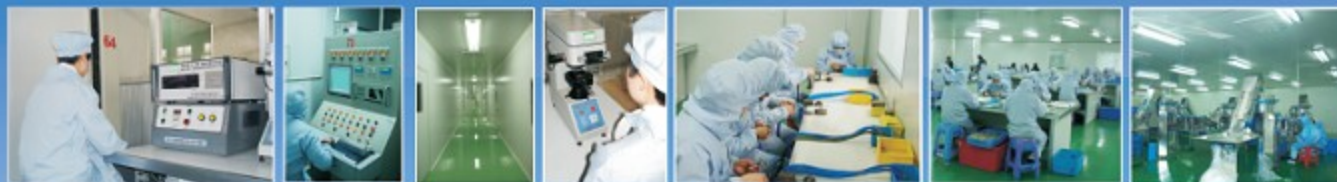
Advanced Test And Producing Facilities

With the standard, strict and high efficiency management policy, the target of KANGNING is to make every customer believe KANGNING forever.