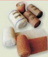
» Elastic Bandage

» Surgical Gloves (6.5", 7", 7.5", 8", 8.5") Latex Examination Gloves (L,M,S) Vinyl Gloves (L,M,S) PE Gloves (L,M,S)