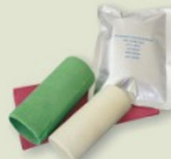
» Orthopedic Casting Tape